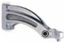
Stainless Steel Mounting Arm