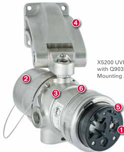
X5200 UVIR Flame Detector with Q9033B Stainless Steel Mounting Arm