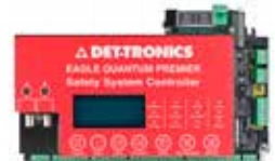
Eagle Quantum Premier® Safety System