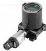
FlexVu® Universal Display with GT3000 Toxic Gas Detector