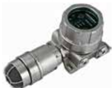
FlexSonic® Acoustic Leak Detector