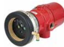
Universal Air Shield Assembly