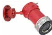
xWatch Explosion-Proof Surveillance Camera