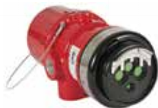
X3301 Multispectrum IR Flame Detector