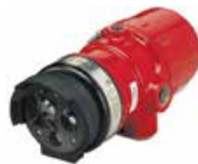
X-Series Weather Shield