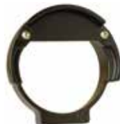
Field of View Limiter/ Weather Shield