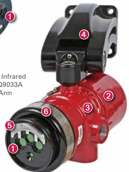
X3301 Multispectrum Infrared Flame Detector with Q9033A Aluminum Mounting Arm