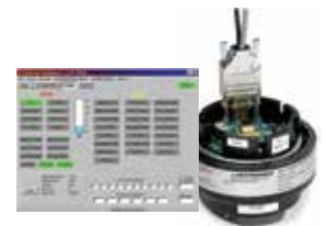
Inspector Connector with Monitor Software