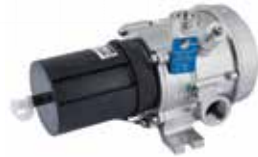
PointWatch Eclipse® IR Combustible Gas Detector