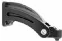
Aluminum Mounting Arm